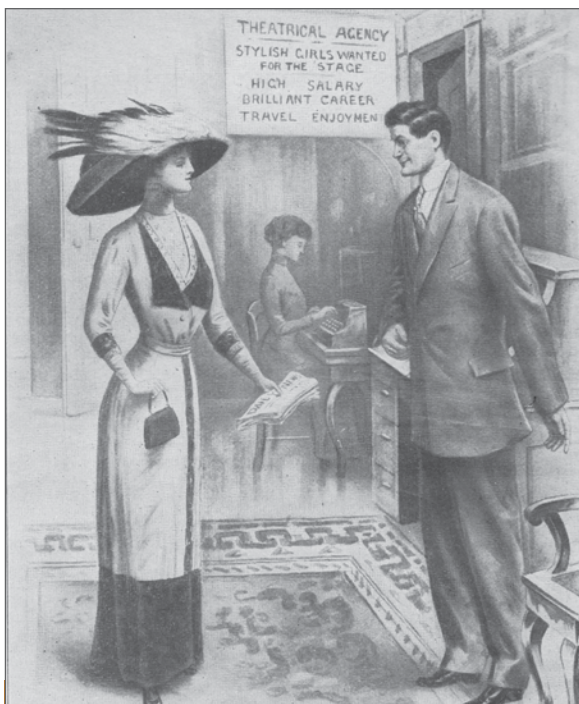
Traffickers prey on victims' hopes for a better life, a technique that was understood even a century ago in texts such as Ernest Bell's 1910 book, FIGHTING THE TRAFFIC OF YOUNG GIRLS .

Being identified as a victim of human trafficking means more than simply being named as the complainant in a prosecution. When adequate anti-trafficking laws are enforced, identification of a person as a victim must begin with a process that respects their rights, provides them protection, and enables them to access services to recover from the trauma inflicted by traffickers. However, when authorities misclassify or fail to identify victims the victims lose access to justice. Even worse, when authorities misidentify trafficking victims as illegal migrants or criminals deserving punishment, those victims can be unfairly subjected to additional harm, trauma, and even punishment such as arrest, detention, deportation, or prosecution. These failures occur too often, and when they do, they reinforce what traffickers around the world commonly threaten their victims: law enforcement will incarcerate or deport victims if they seek help.