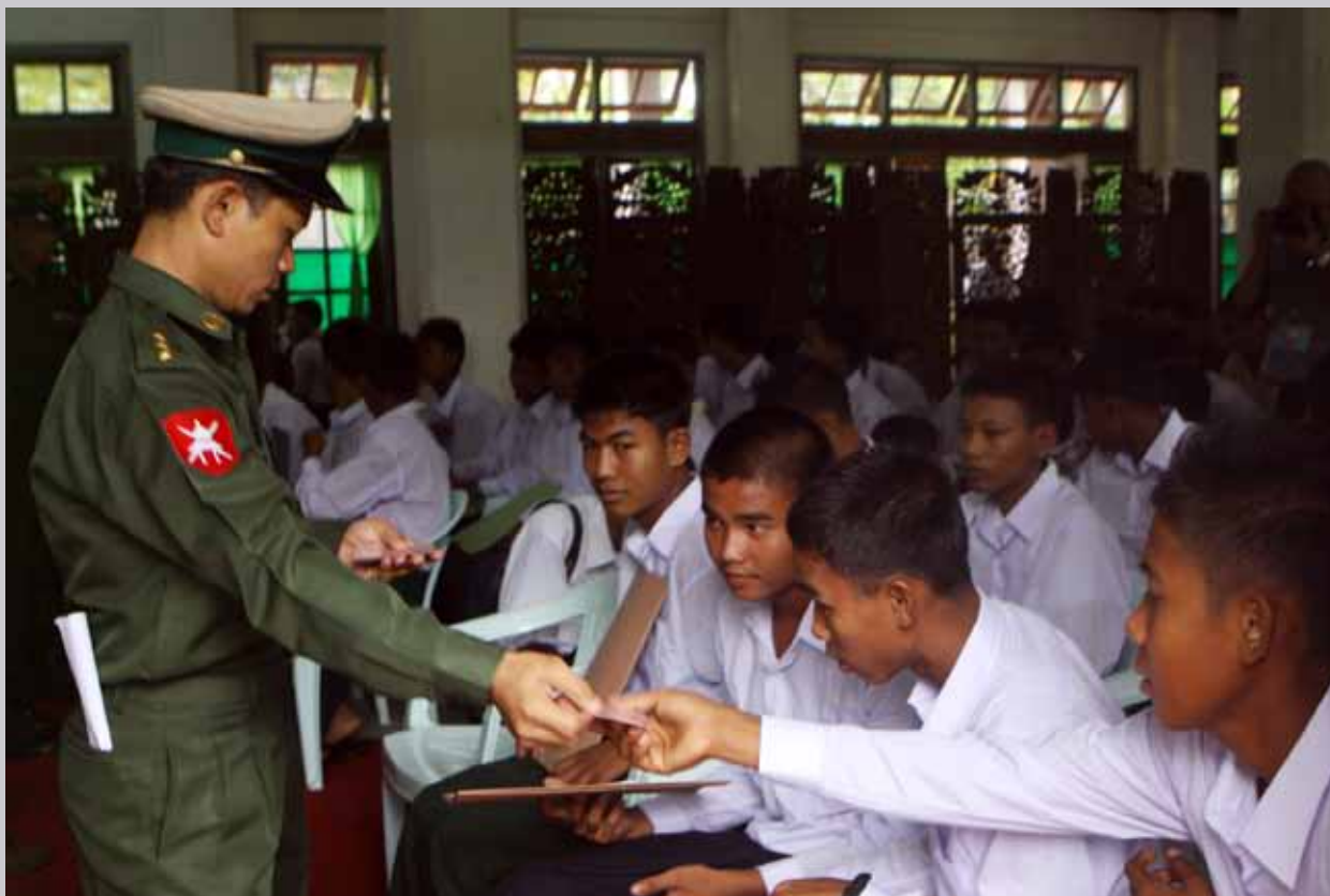
A Burmese soldier gives national identity cards to demobilized child soldiers during a ceremony in Yangon where the children were reunified with their families. Burma has signed an action plan with the UN on the identification, release, and rehabilitation of children in the Burmese military.

The term “child soldier” includes any person described in clauses (ii), (iii), or (iv) who is serving in any capacity, including in a support role such as a cook, porter, messenger, medic, guard, or “sex slave”.