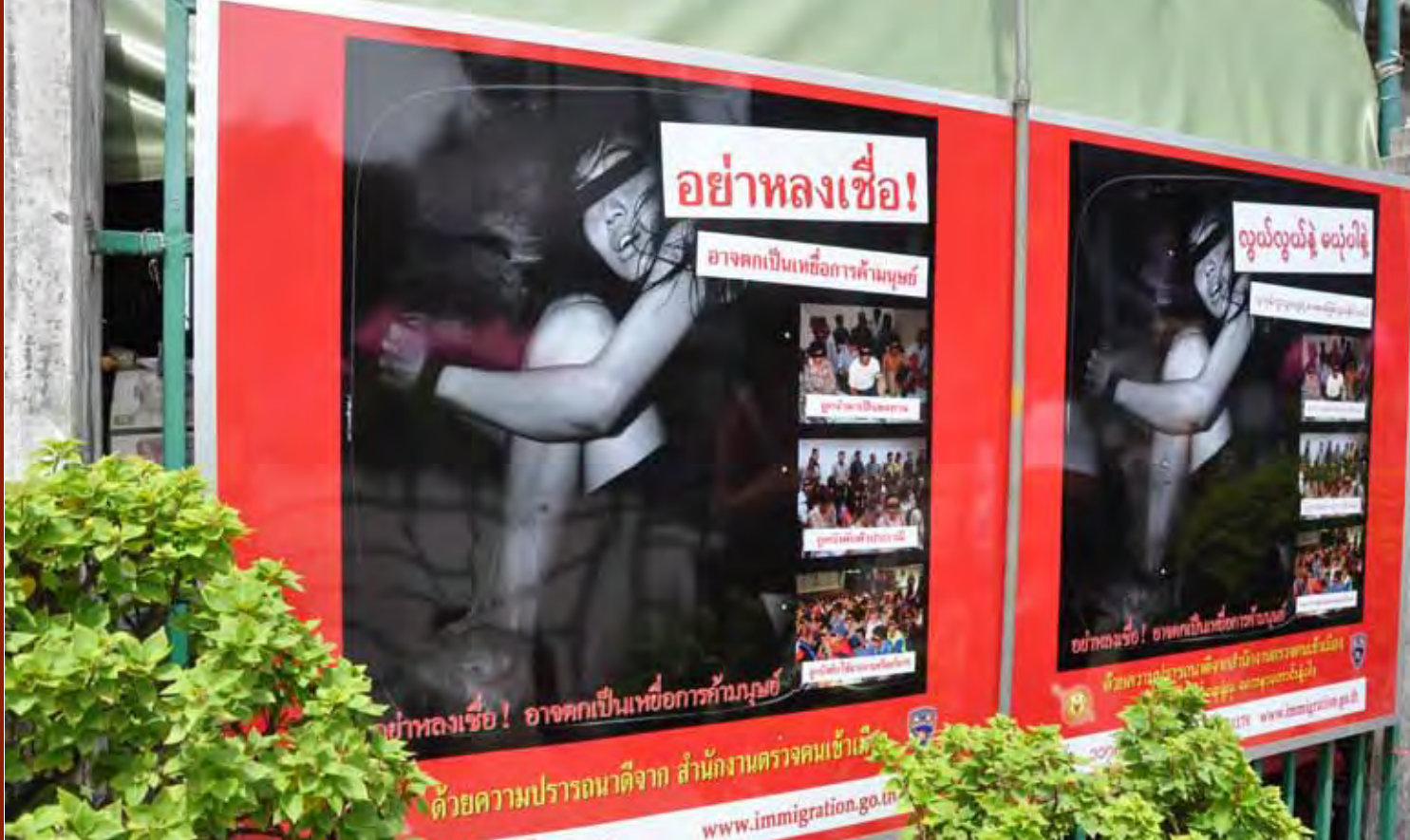
A poster located just inside Thailand near the border with Burma at Mae Sai warns the public about human trafficking. The majority of the trafficking victims within Thailand are migrants from neighboring countries who are forced, coerced, or defrauded into labor or commercial sexual exploitation.