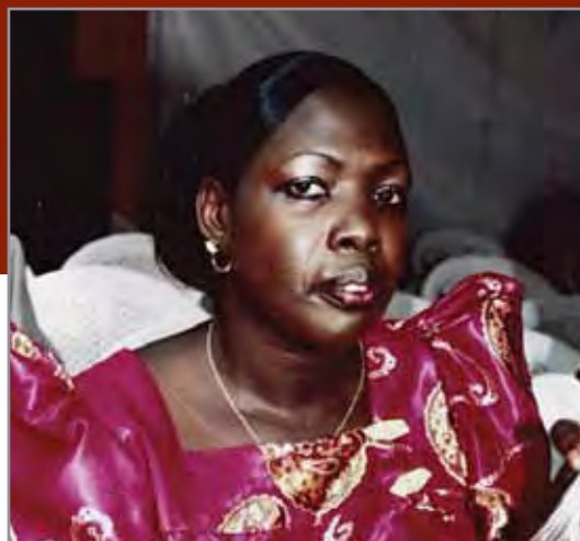
Eunice Kisembo, Uganda

2012 saw the tragic loss of Eunice Kisembo, the former Head of the Counter Trafficking in Persons Office of the Government of Uganda. Her trailblazing efforts were critical in addressing human trafficking in Uganda, assisting Ugandan victims of trafficking around the world by aggressively investigating potential trafficking crimes, and establishing Uganda's National Task Force against Human Trafficking.