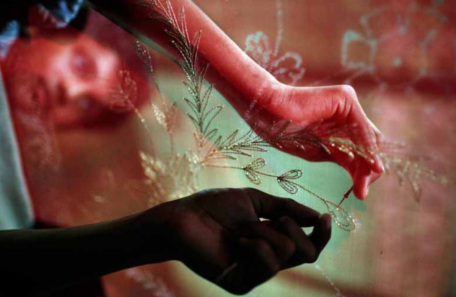
A young boy sews beads and sequins in intricate patterns onto saris and shawls at a zari (embroidery) factory. Boys in Nepal and India often work long hours seven days a week year-round, and are routinely subjected to physical abuse.