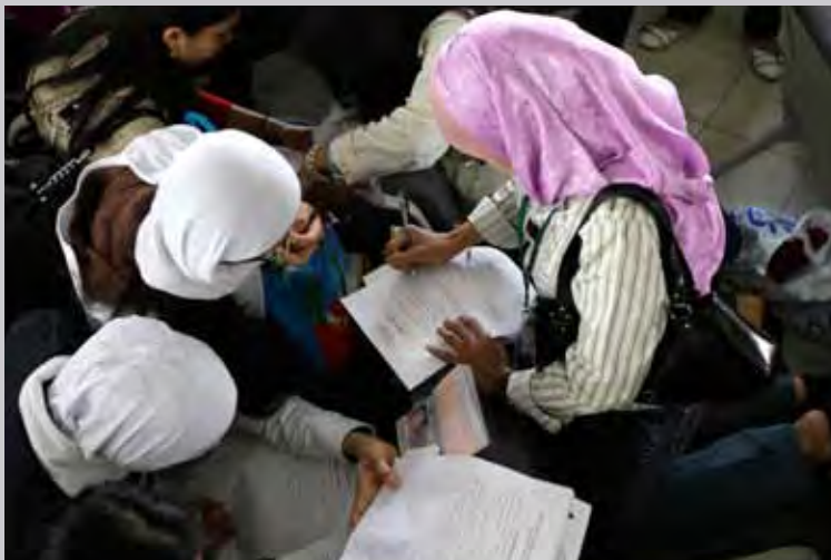
Overseas Filipino Workers (OFWs), most of whom are young women who worked in domestic service fleeing the civil war in Syria, fill out immigration forms at the Ninoy Aquino International Airport in Manila, the Philippines, upon arrival via a chartered flight by the International Organization for Migration (IOM).

Establishing regulations, agreements, or standard operating procedures with NGOs to identify victims: In Taiwan, foreign workers are screened at detention centers for indicators of trafficking. If individuals are identified as potential trafficking victims, they are offered services in a shelter and a reflection period to come forward as a victim. If they report their trafficking experience by the end of the reflection period and are confirmed by Taiwan authorities to be victims of trafficking, they are entitled to remain at the shelter and receive comprehensive services including help obtaining employment. In Scotland, local law enforcement officials facilitate better victim identification by taking children from cannabis farms to safe houses instead of into detention centers.